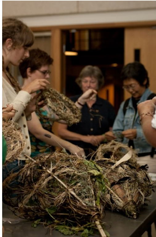
Making nest sculptures from organic materials at the Roundhouse.