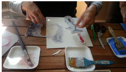
Playdate in progress.

Finishing off – tips for attaching hanging mechanisms and showing your work.