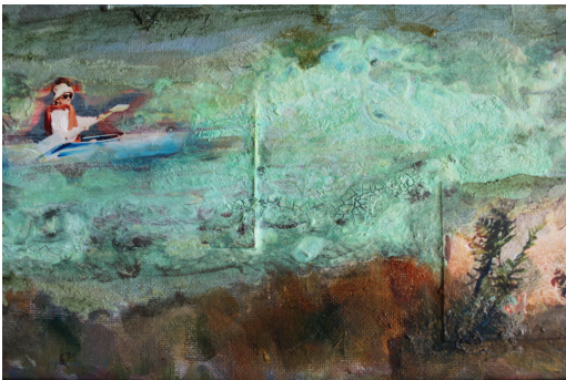
Paddling in Paradise (detail) Mixed-media piece using altered photographs and rust/copper solvents.

I'm available to do a demonstration, artist talk or workshop at your own location.